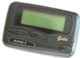
ALPHA4 GOLD Pager