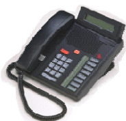
Page using touch-tone telephones