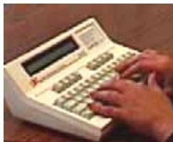
Fast typing Stand-alone